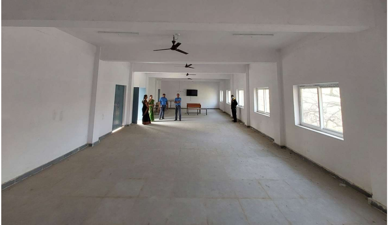
Pic 5 – Seminar / Meeting Hall