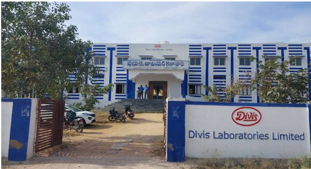
Pic1 – The Front View of the Government Junior College, Choutuppall