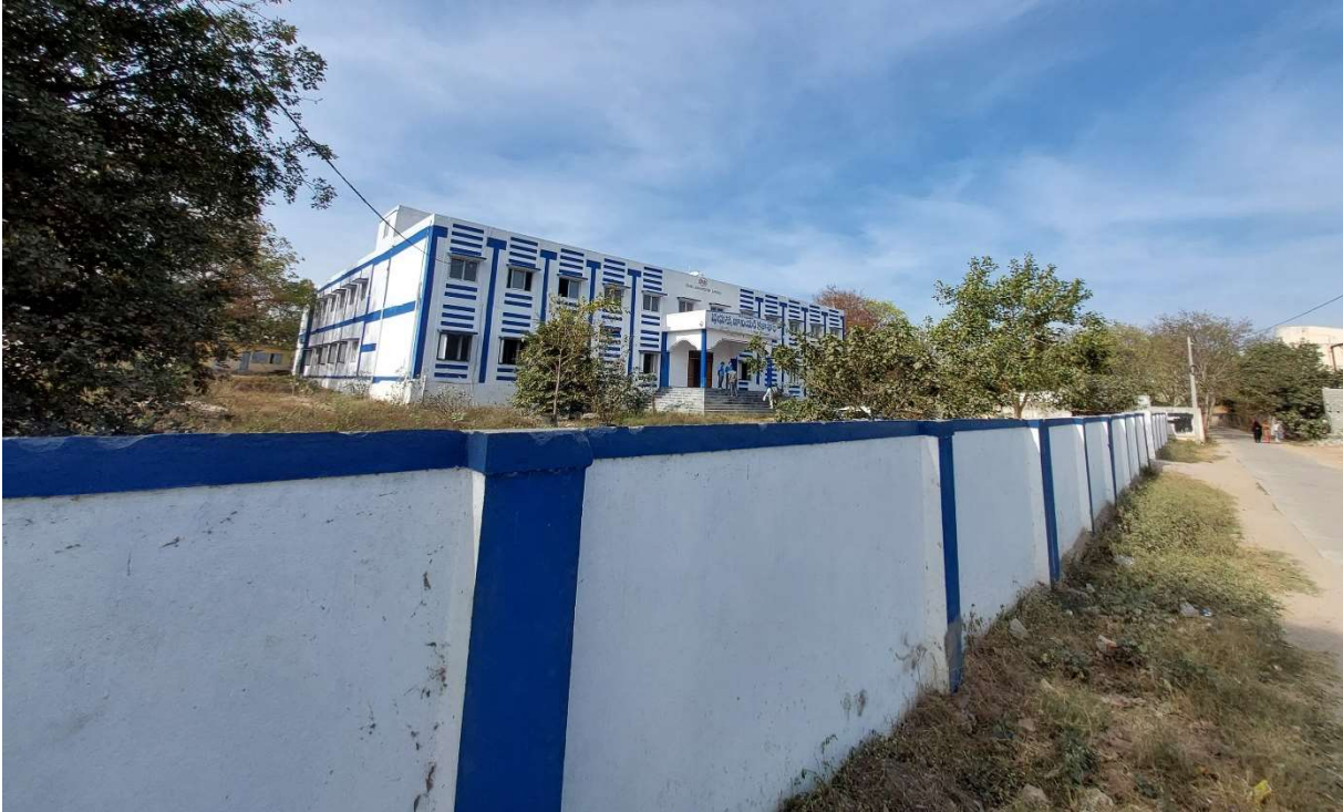
Pic 2 – Newly Constructed Compound Wall of the College