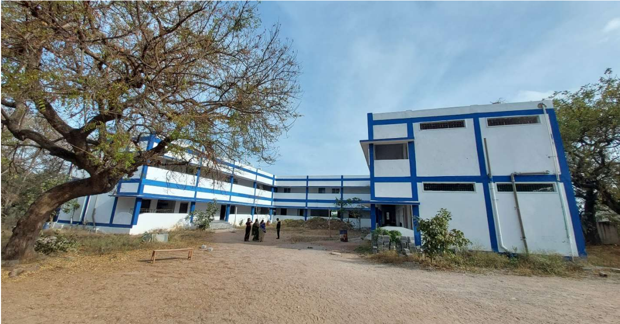
Pic 3 – View of the College Building