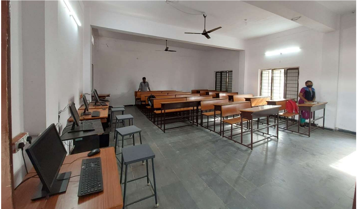
Pic 4 – Newly Constructed Classroom