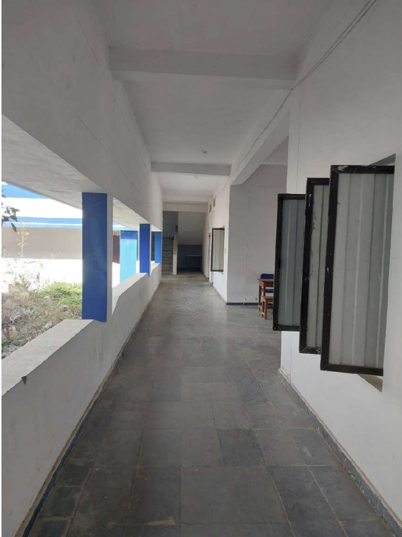
Pic 6 – Tiled Corridor in the First floor

Any place that anyone can learn something useful from someone with experience is an educational institution – Al Capp