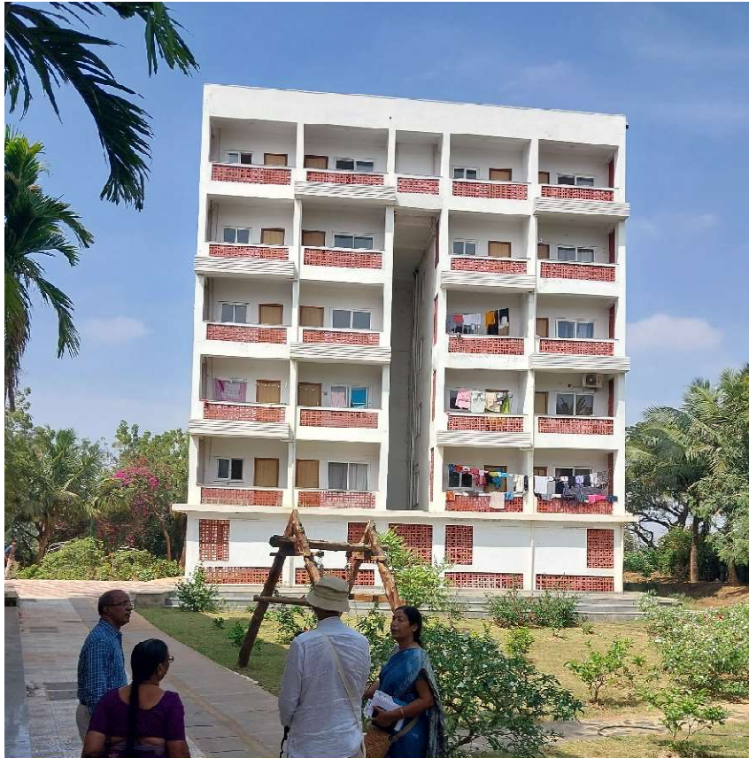
Pic 2 - Lateral View of the Staff Residence Building