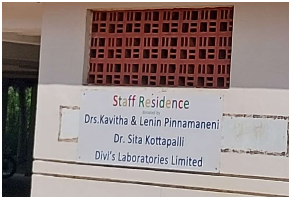
Pic 3 - Board denoting the donors of the staff residence