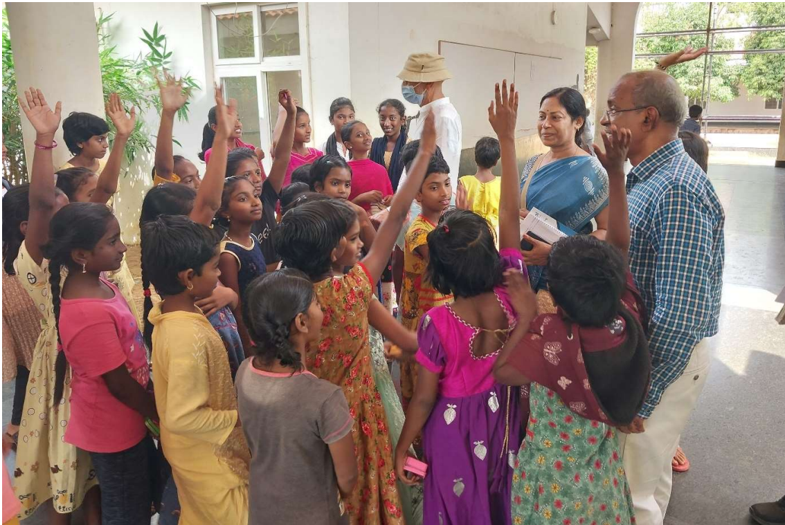
Pic 1 – Interaction with children in the presence of the CEO and the Founder of HEAL School