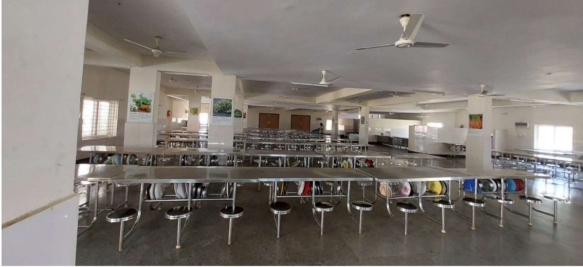
Pic 12 - View of Dining Hall