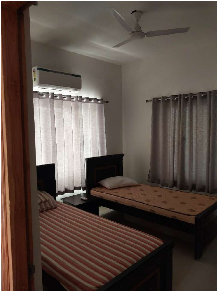
Pic 5 – View of Second Bedroom