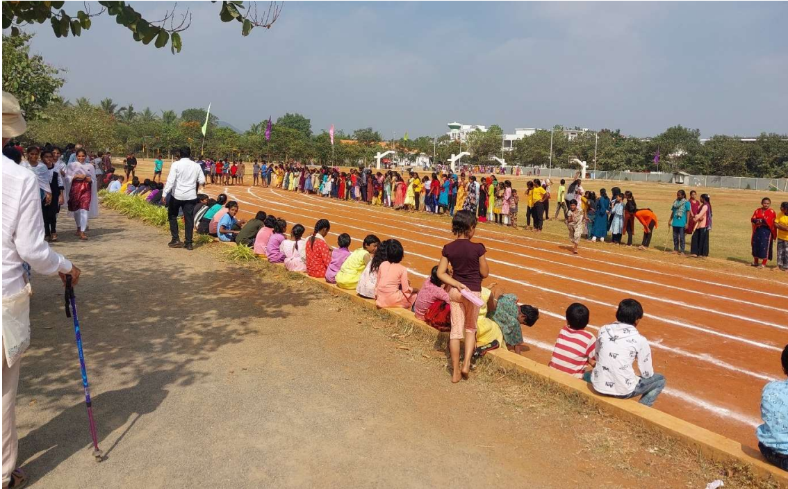
Pic 8 – Children participating in the track events competitions