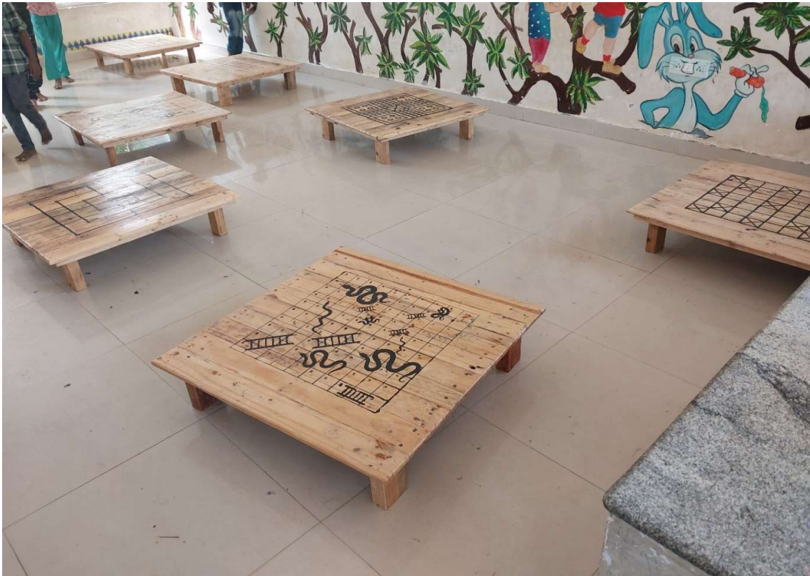
Pic 9 – TLM from Waste Material and used for Joyful Learning at Heal School