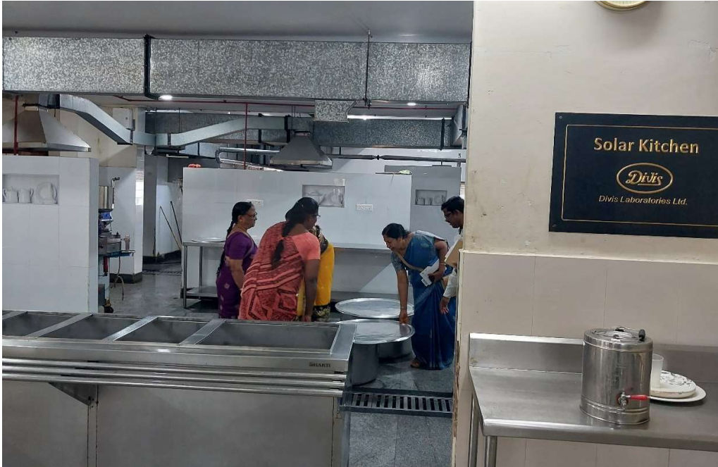
Pic 10 – Solar Kitchen View at Heal School