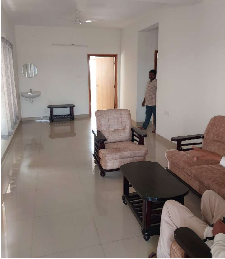
Pic 6 - View of Drawing Room