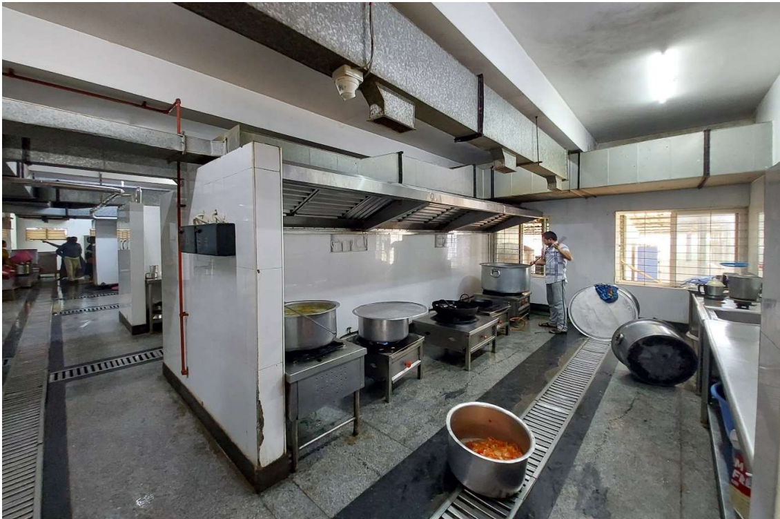
Pic 11 – Inside View of the Solar Kitchen