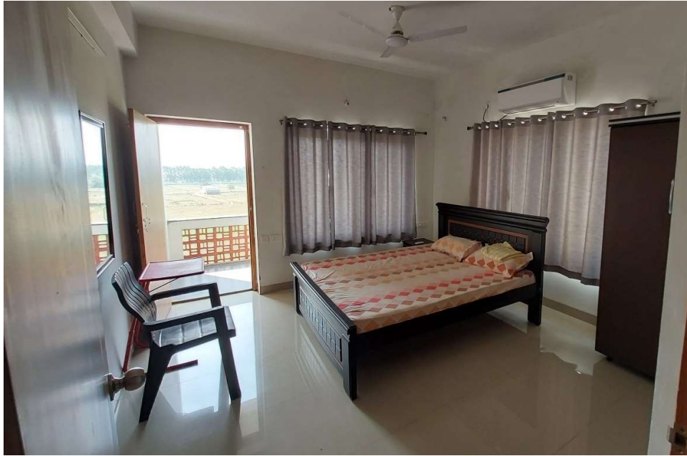
Pic 4 – View of the Bedroom with Balcony