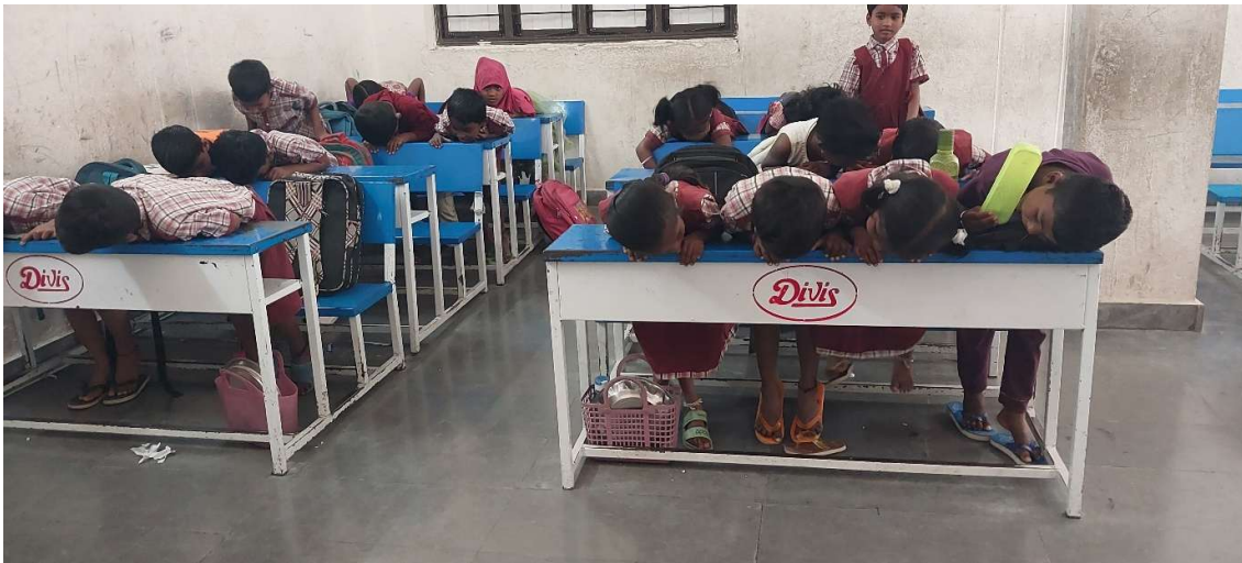
Pics 12 & 13 – Students actively participating in activities conducted by the study team

EDUCATION IS SIMPLY THE SOUL OF A SOCIETY AS IT PASSES FROM ONE GENERATION TO ANOTHER - G. K. Chesterton