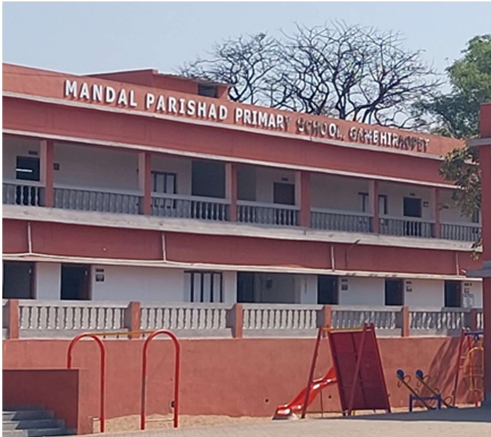
Pic 2 – Front view of the school building