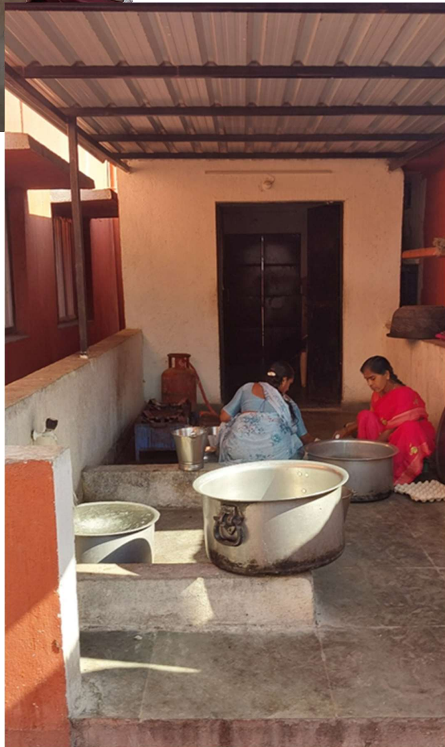
Pic 11 – Kitchen team preparing mid-day meals