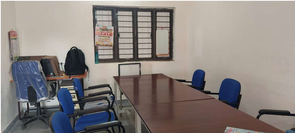
Pic 9 – Furniture provided in the staff room