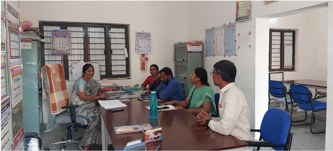
Pic 8 – Interaction with teachers and the Head Teacher