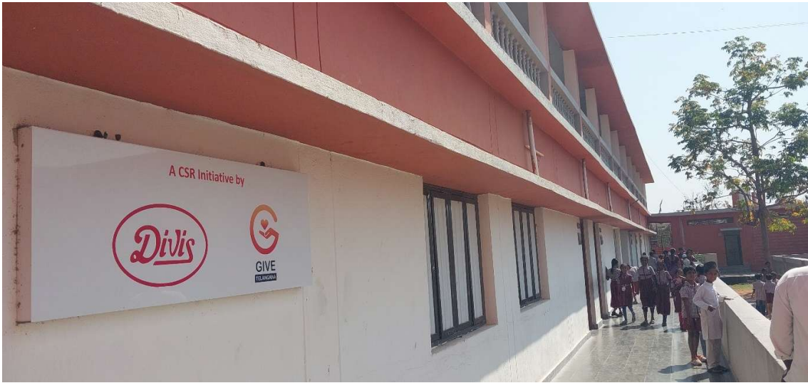
Pic 4 – Outside view of the class rooms