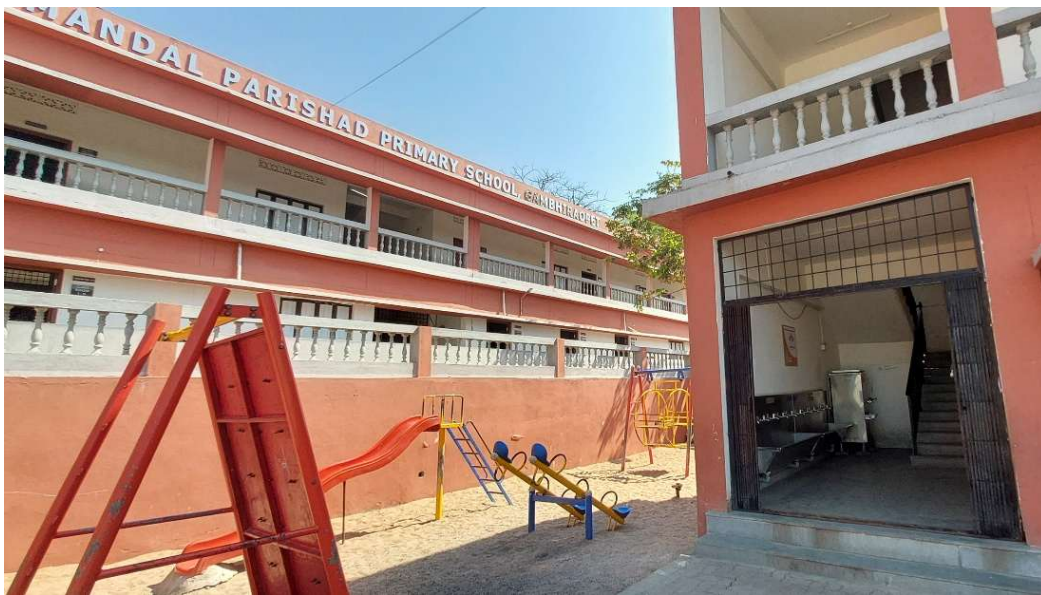
Pic 3 – Play area in front of the school building