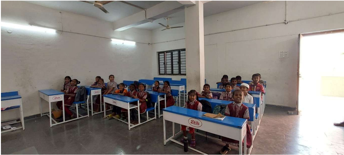
Pic 6 – Classroom view with various amenities – dual desk benches, lights, fans, wide windows and doors