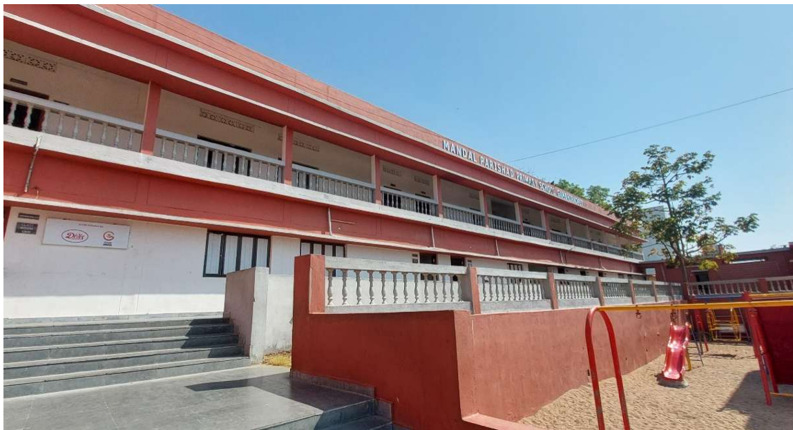
Pic 1 – View of the newly constructed MPPS building in the KG-to-PG campus