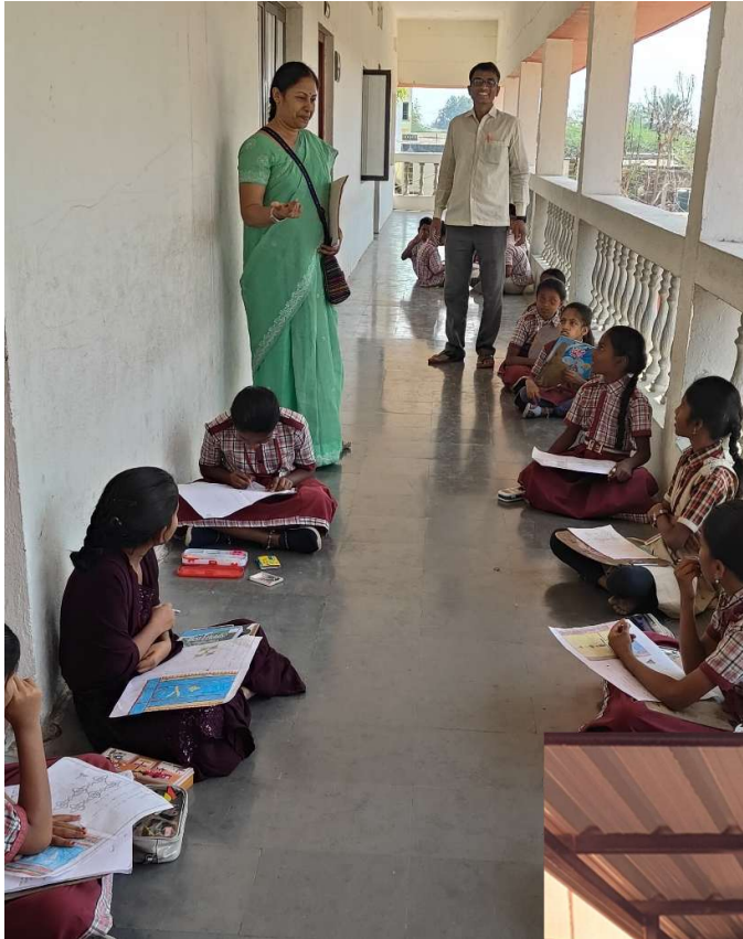
Pic 10 – Class 5 students using the corridors for extra-curricular activities