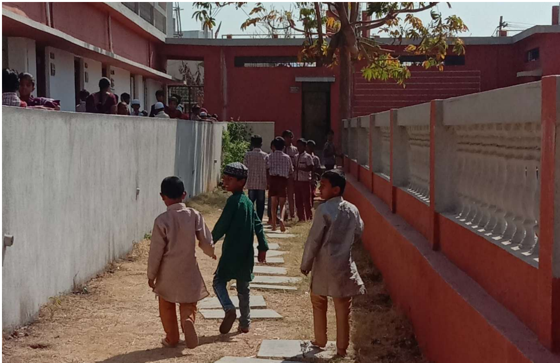
Pic 5 – Children accessing the toilets