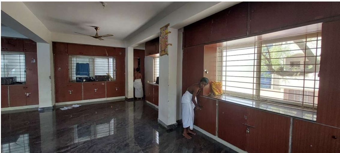
Pic 6 – Students using their personal cupboards