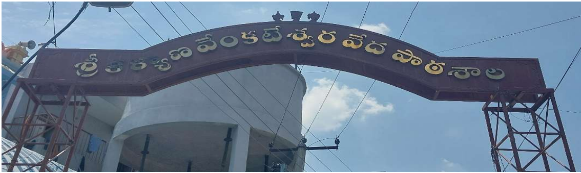
Pic 1 – Arch at the entrance of Veda Pathasala