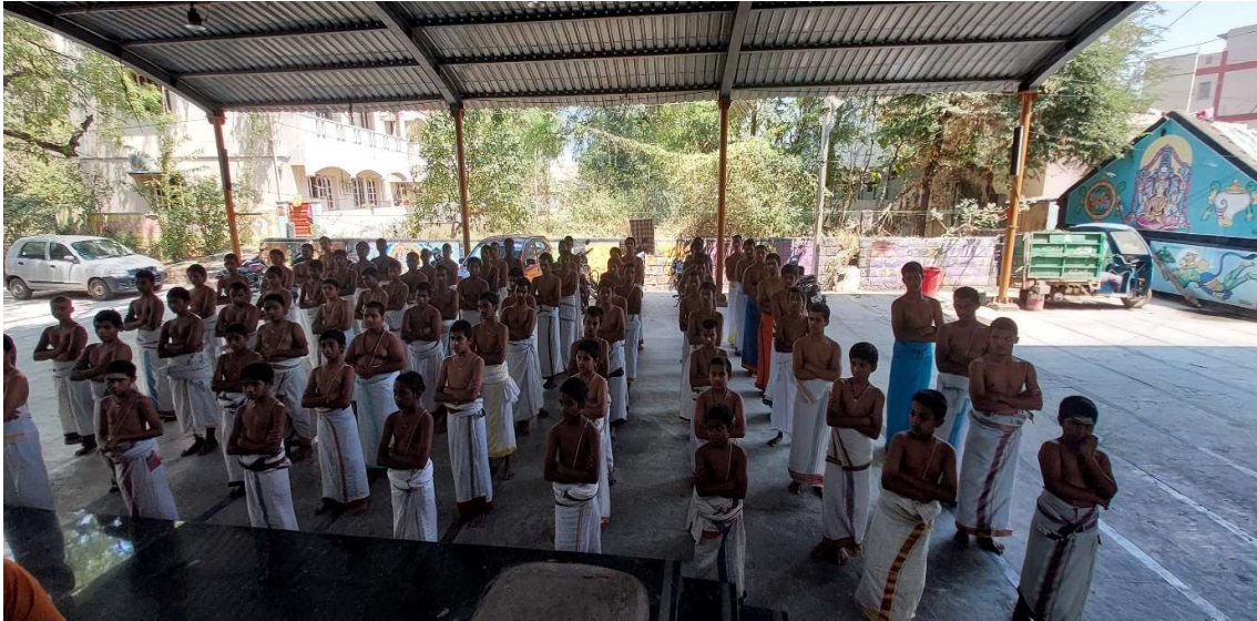
Pic 3 – Students reciting the hymns