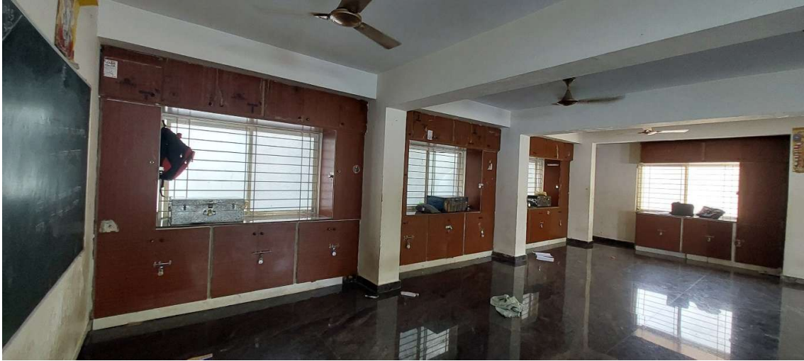
Pic 5 – A view of the classroom with neatly set wall-to-wall cupboards