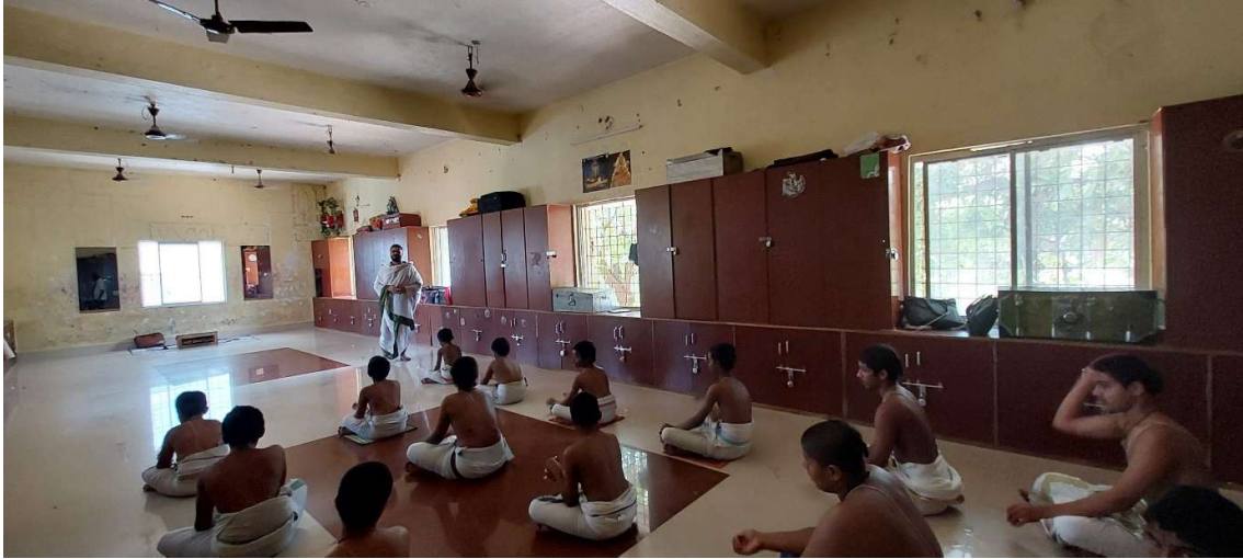
Pic 7 – Students practicing their learnings in performing rituals