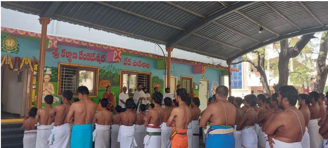
Pic 2 – Students assembled in the shed outside the Pathasala