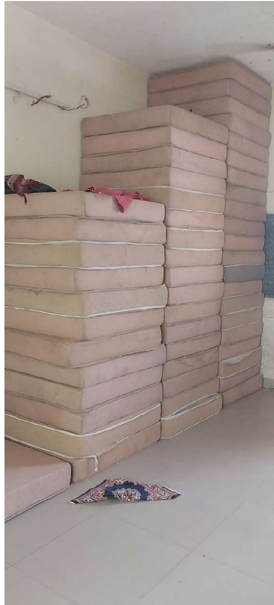
Pic 10 – Mattresses provided in the yoga room

The Vedas are the greatest source of knowledge, providing insights into the nature of life, the universe, and the ultimate truth