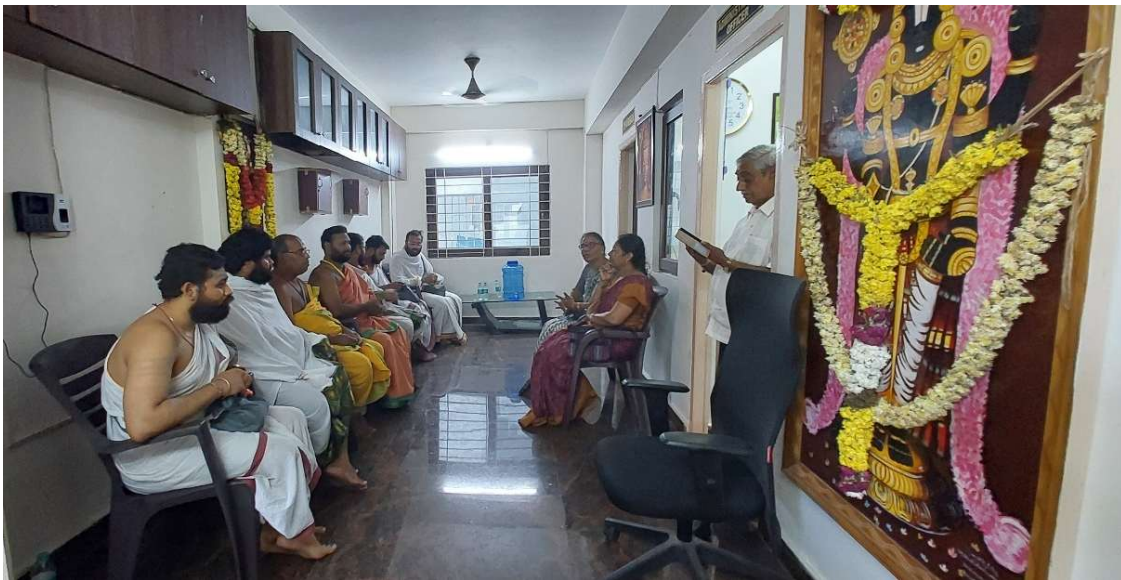
Pic 4 – Interaction with representatives of the Teachers, Trustees and the administration