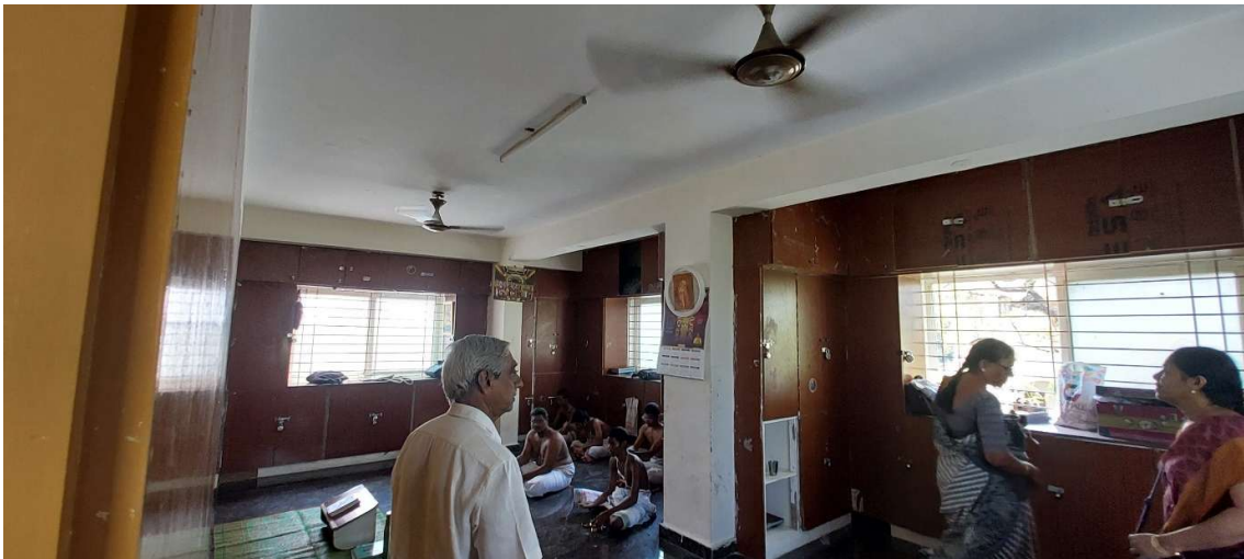
Pic 8 – Study team observing the premises along with the Trustee and office authorities