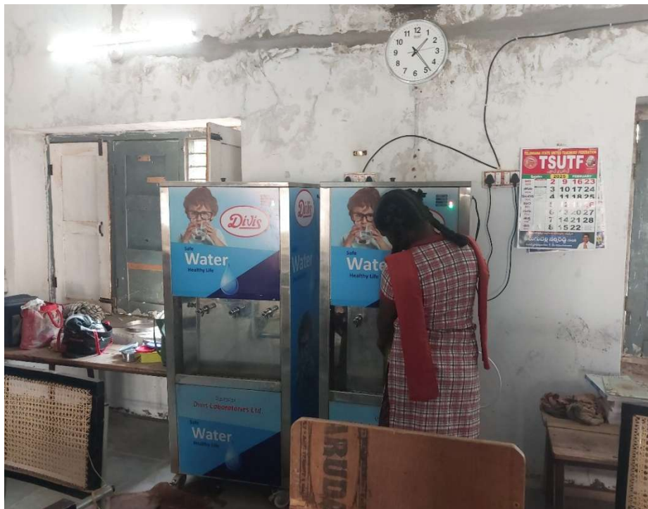
Pic 4 – High school student collect water from the unit installed in the staff room