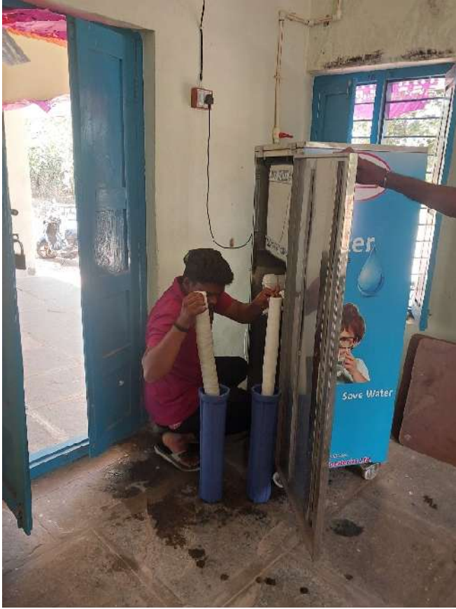
Pic 7 – Technician changing the filter candles