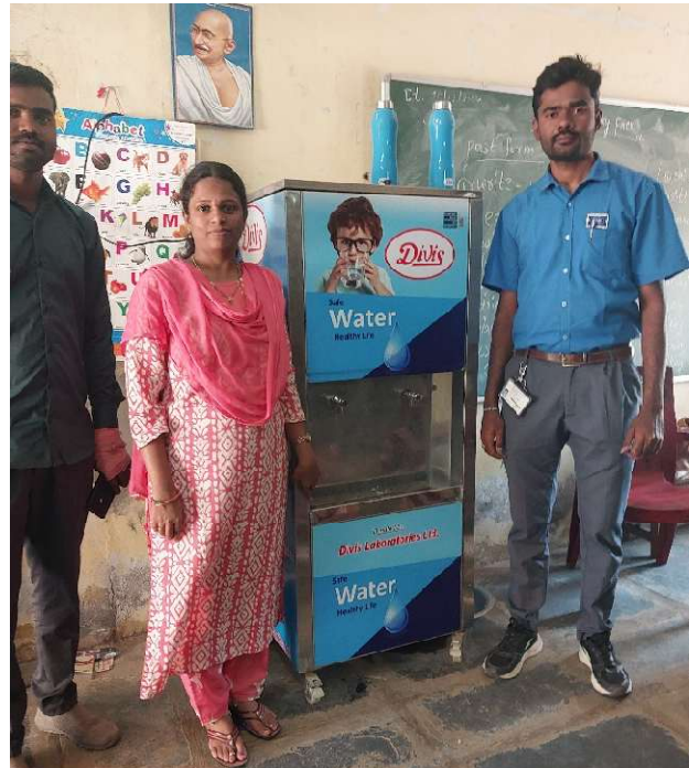
Pic 10 – Interaction with the HM and the technicians

Anyone who can solve the problems of water will be worthy of two Nobel prizes - one for peace and one for science