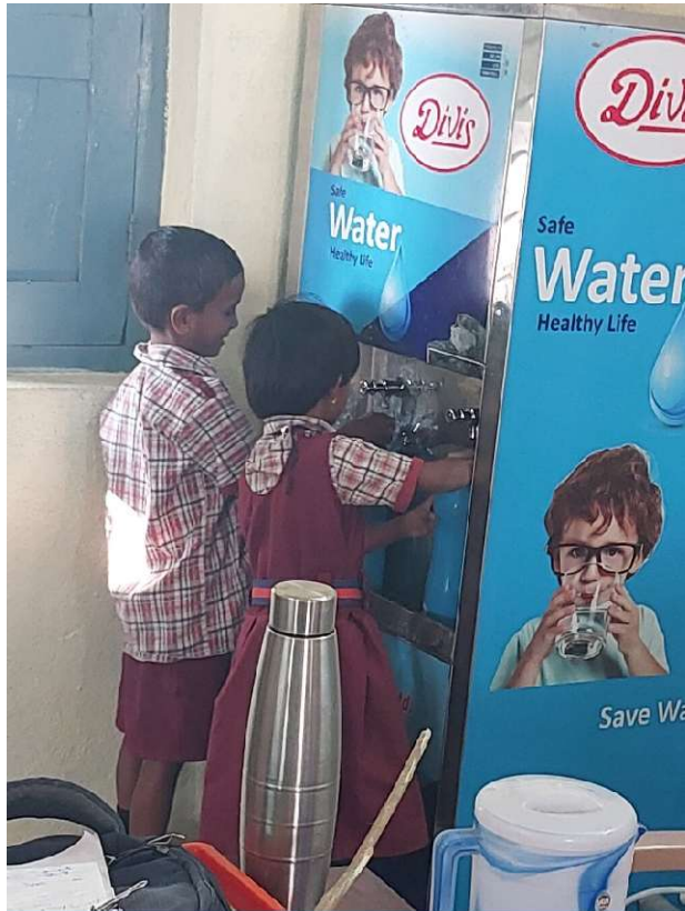
Pic 1 – Children collec water from the unit placed in the HM’s room