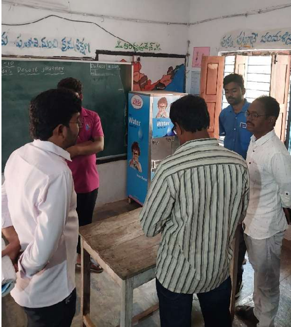
Pic 9 – Interaction with the Teachers and the technician