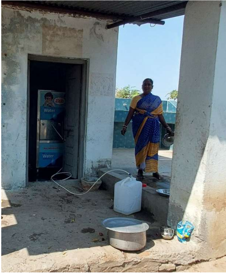
Pic 5 - Water purifier installed in a separate room & water being filled in the can using extended pipe for cooking purpose