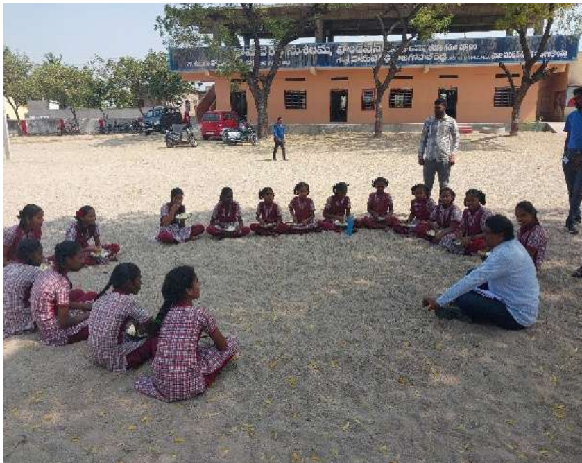
Pic 6 - interaction with 5 th class students