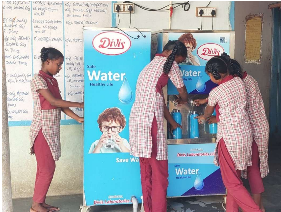
Pic 3 – KGBV Students collect water from the water unit