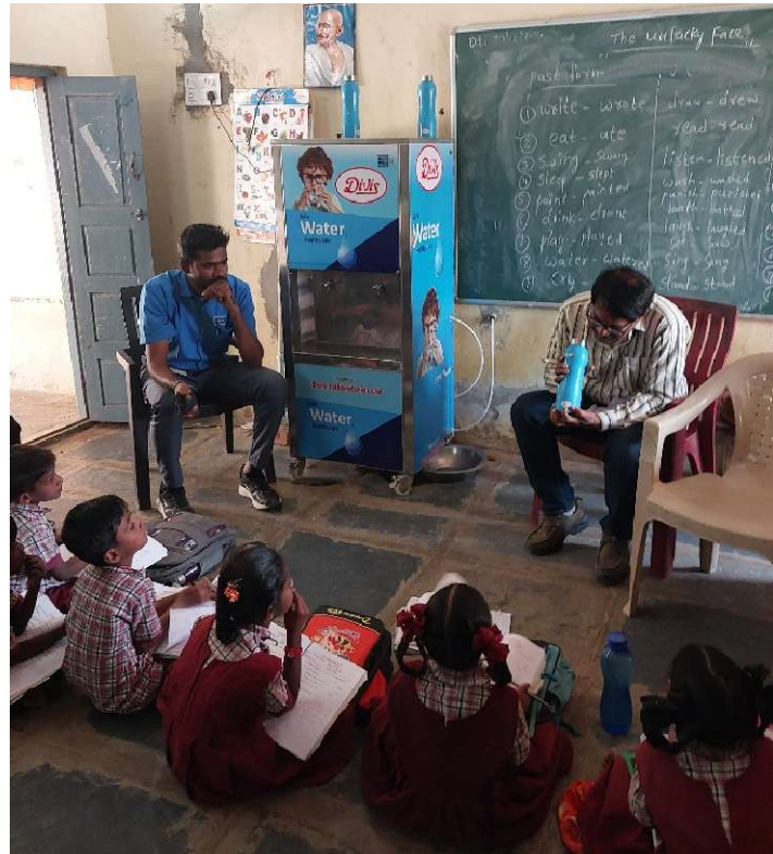
Pic 8 – Interaction with the students